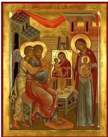
Evangelist St. Luke painting, feast 10/18